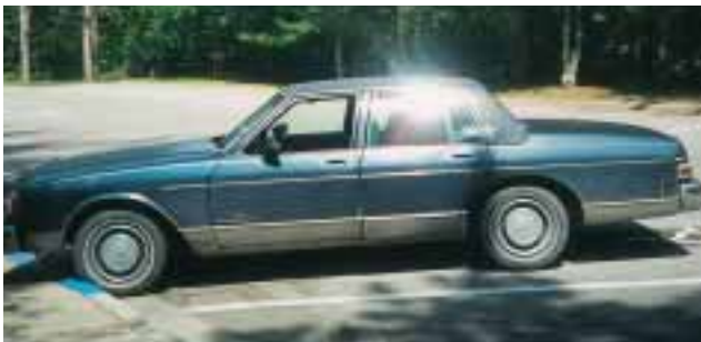
1985 Pontiac Parisienne with 335,000 miles

"AMSOIL has helped me get maximum value out of four vehicles now. My 1985 Pontiac Parisienne has over 335,000 miles on it and still runs strong and smooth. We've kept it up, but as far as I'm concerned, the secret is lubrication. I feel very indebted to AMSOIL. No way would this car have given us this fine service with conventional oils."